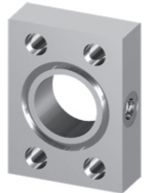
Model 1301 / 1302

3181 TRI-PARK DR. GRAND BLANC, MI 48439 800-521-7918 810-953-1380 FAX 810-953-1385 INFO@MAINMFG.COM