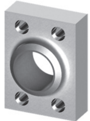
Model 6279 / 6281